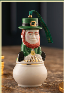
2023 Annual Ornament - Leprechaun 36th Edition Piece

1120 Third Avenue, Spring Lake, NJ 07762 732.449.6650