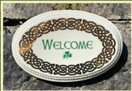
Celtic Welcome Plaque