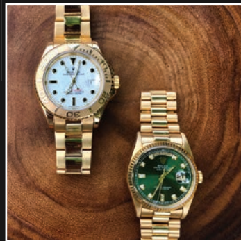
Rolex White Dial GMT- MASTER & Emerald Green Diamond Dial DAY-DATE, 18K Gold