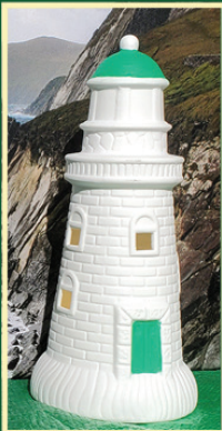
Wild Atlantic Way Lighthouse