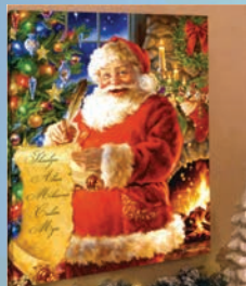
SANTA'S NICE LIST Add up to 15 names on Santa's list

Orders must be placed by Dec. 1st for Christmas Delivery