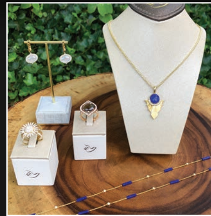
The Dove Collection