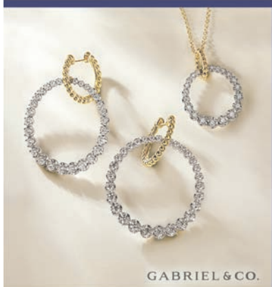
GABRIEL & CO.