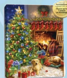
COZY CHRISTMAS Add up to 7 names on the stockings