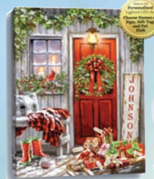
HOME FOR CHRISTMAS Personalize the porch sign name, dog dish names (up to 2) and package tags (up to 6 names)